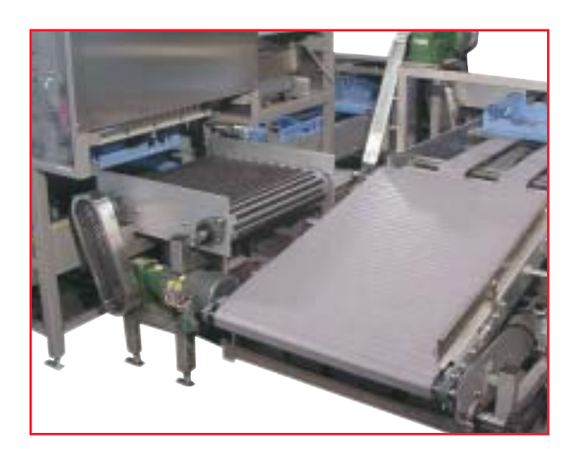
Discharge Conveyor with Kicker Conveyor